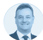
Nick SHERRY SINGAPORE ECONOMIC FORUM