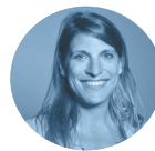
Prune DES ROCHES ANDERA PARTNERS