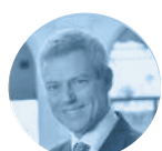
Olivier ROUSSEAU FOND DE RESERVE POUR LES RETRAITES