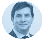
Hervé BESNARD RIVAGE INVESTMENT SAS